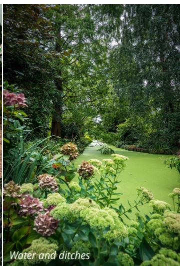
Water and ditches